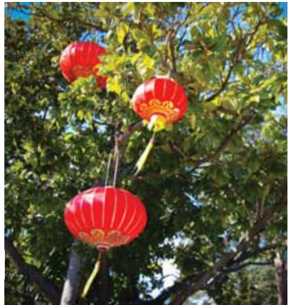
Moraga Way residents celebrate Chinese New Year by hanging red lanterns from a front yard tree.